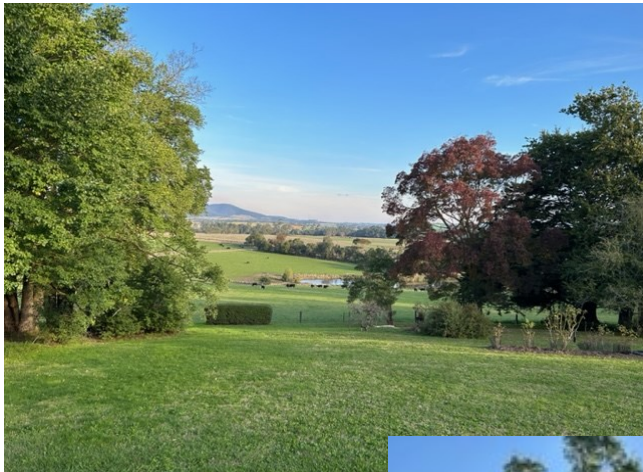
Scenes at Tarrawarra Abbey at this week's parish retreat.